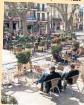
WATCHING THE WORLD: Majorca cafe