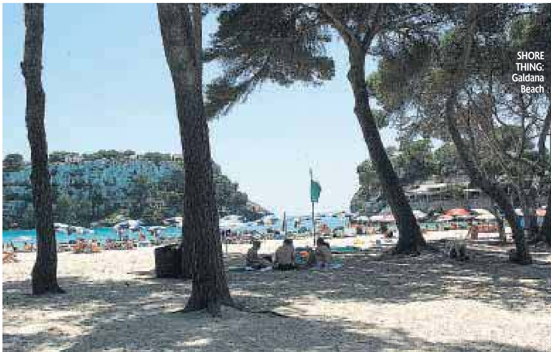
SHORE THING: Galdana Beach