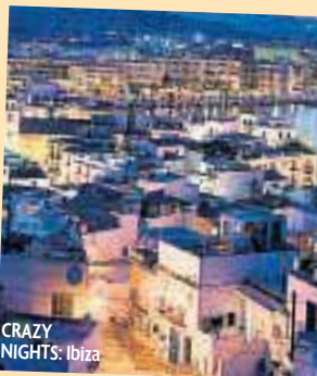
CRAZY NIGHTS: Ibiza

If you are eating out try Forn De St Joan, a truly superb tapas bar and