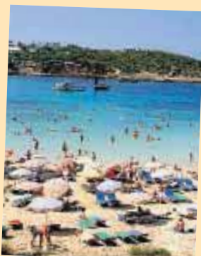
GOLDEN SANDS: A busy beach in Ibiza