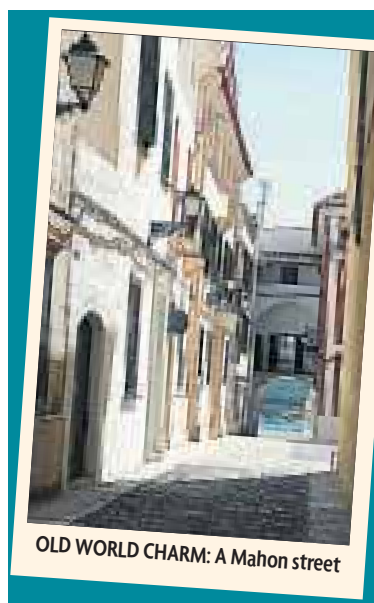
OLD WORLD CHARM: A Mahon street