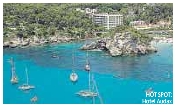
HOT SPOT: Hotel Audax